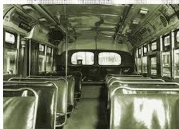
Montgomery Bus Boycott, 1956